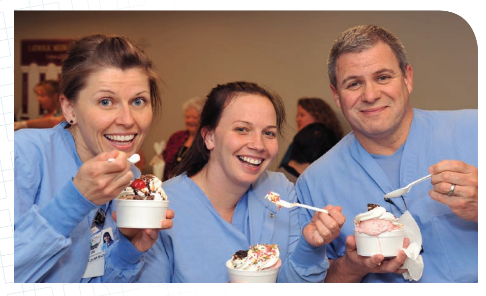
CMC Employees are treated to an ice cream social to celebrate their Business of the Year award.

CMC thrives with Continuous Improvement and Innovation