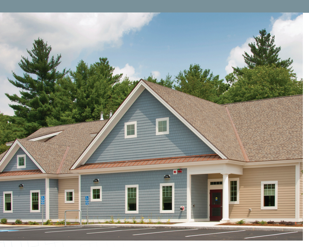
CMC's new Hooksett Medical Park —home for a new primary care practice, laboratory services and physical therapy.