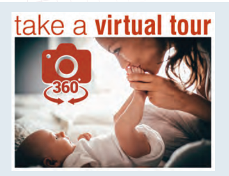
Know what to expect when you're expecting. Tour the extraordinary facilities at our Mom's Place and Special Care Nursery from the comfort of your home. Visit: CatholicMedicalCenter.org/Moms-Place

FREE, registration required, call 603.626.2626