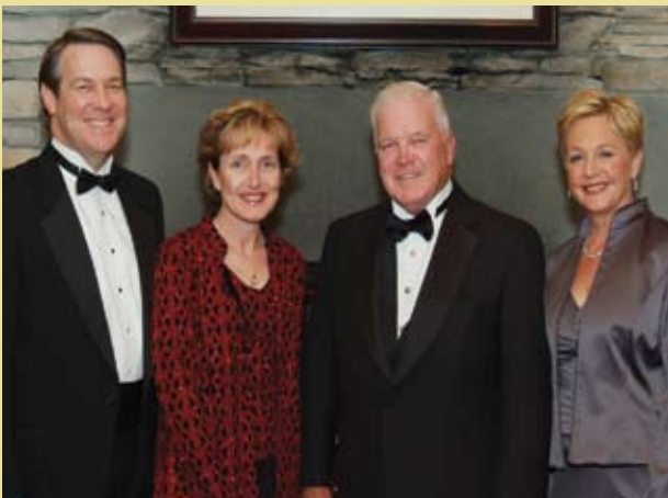
Middle Photo Physicians and staff of Bedford Women's Care