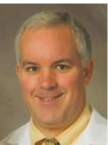
CONNOR J. HAUGH MD, FACC

The task force concluded that pharmacologic treatment of AF should almost always precede catheter ablation. The main indicator for catheter ablation for AF is symptomatic AF refractory or intolerant to at least one Class 1 or Class 3 antiarrhythmic medication. The treatment may also be used with symptomatic patients with heart failure or a lower ejection fraction. Patients with asymptomatic AF or a left atrial thrombus are not good candidates for catheter ablation.