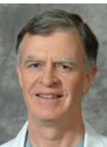
DAVID C. CHARLESWORTH MD, FACS

A trial fibrillation (AF) is the most common cardiac arrhythmia, affecting over 2 million people in the United States. It is frequently symptomatic and even when well-tolerated raises the risk for stroke, heart failure and death. Treatment choices for atrial fibrillation can be complex. Selection of a treatment strategy requires careful consideration of the patient's disease process and balancing of the disease's potential morbidity and mortality with potential side effects and complications.