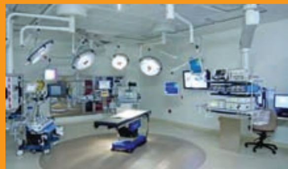
Design example of a state-of-the-art operating suite

For more information about surgical services at CMC, call ASK-A-NURSE at 626.2626 . ■